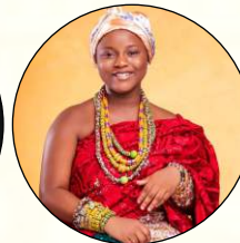
Nakeeyat the poet